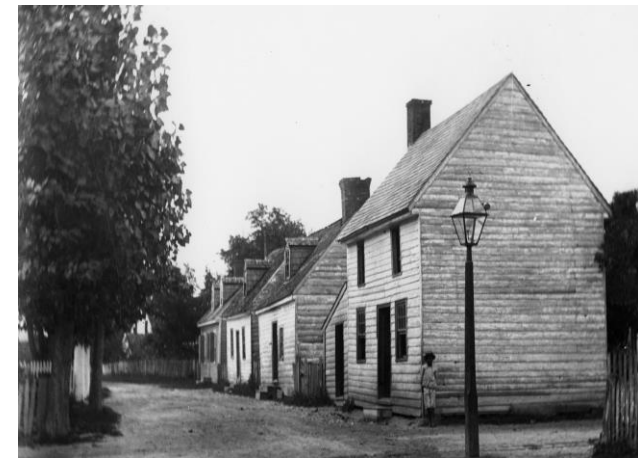
Locust Street, St. Michaels, c. 1910