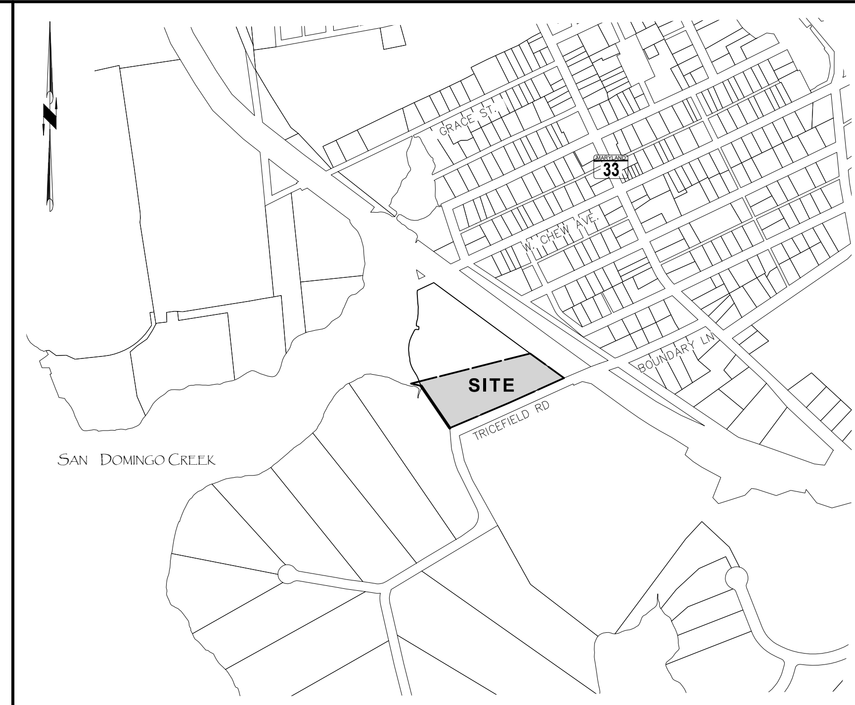
VICINITY MAP SCALE: 1" = 500'