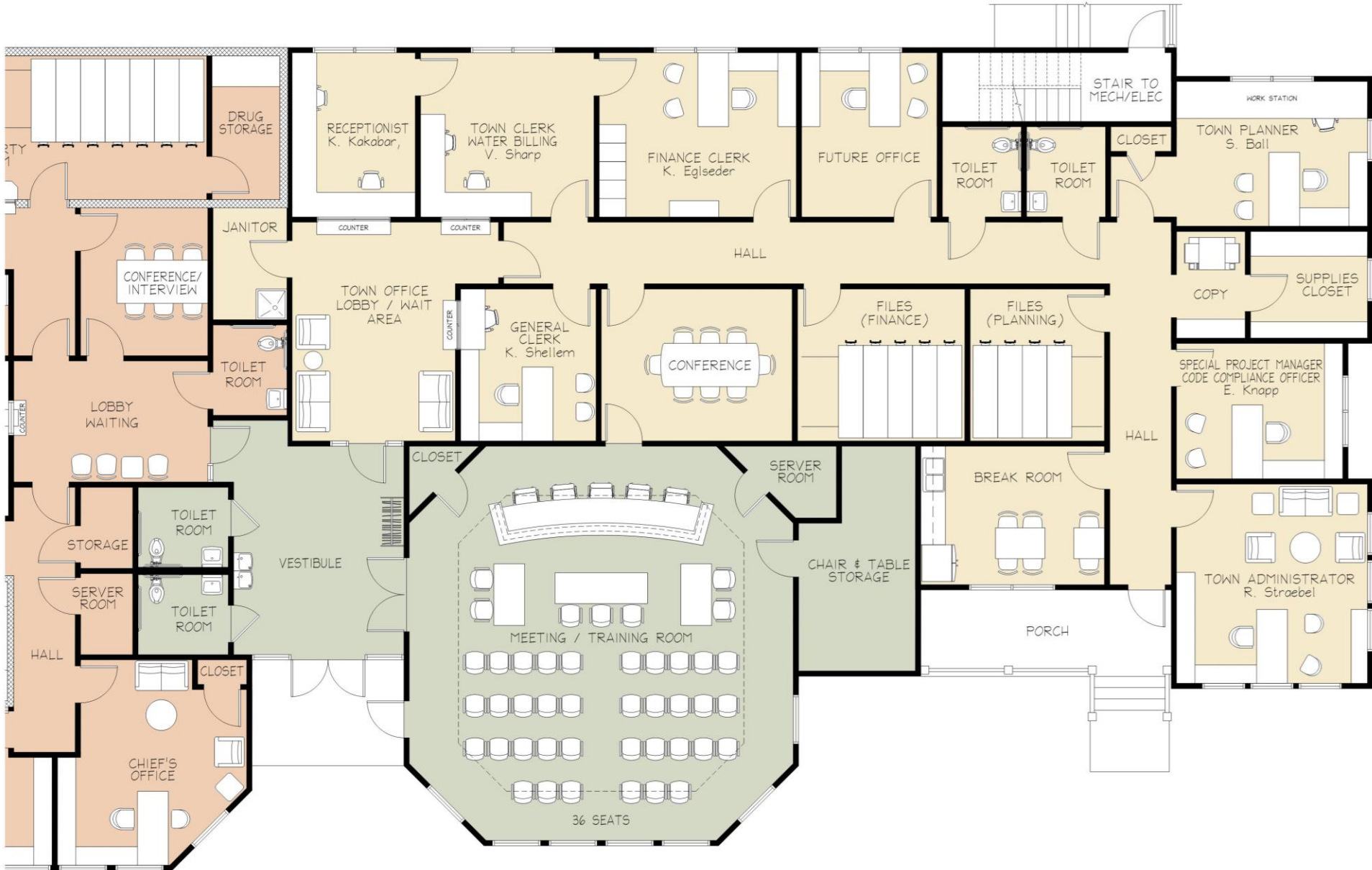
PROPOSED FLOOR PLAN – TOWN OFFICE