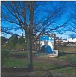
Public Art in Cambridge