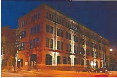
Miller's Court mixed-use rehabilitation in Baltimore