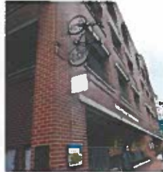
Hagerstown Bicycle Parking