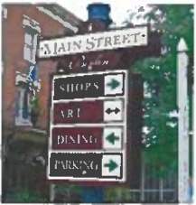
Berlin Main Street