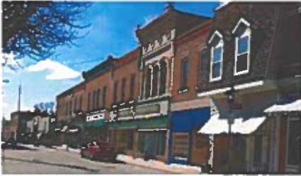
Snow Hill Historic District