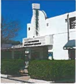
The Greenbelt Theater