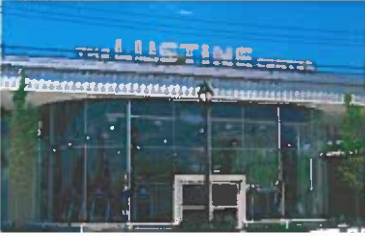
The Lustine Center in Hyattsville