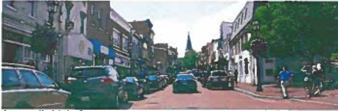
Annapolis Main Street