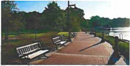
The Wharf in Leonardtown

Maryland Façade Improvement Program (MFIP): MFIP provides funds to local governments for programs to improve the exteriors of commercial properties located within Maryland’s Sustainable Communities. The program supports communities seeking to create consistent, attractive designs for their commercial corridors in order to bolster economic vitality and stimulate new private investments.