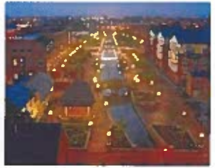
Carroll Creek Park in Frederick